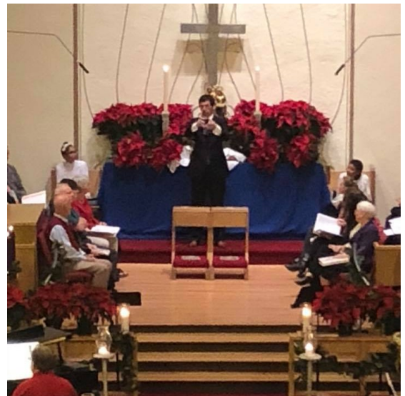
Altar and Communion setup in the traditional service.