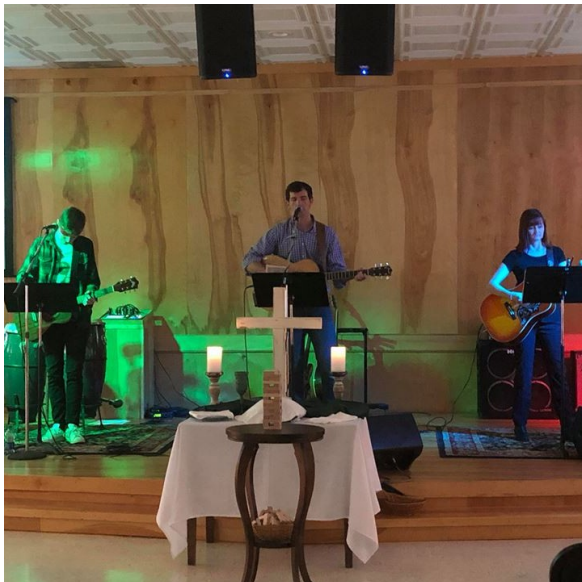
The Current Band.