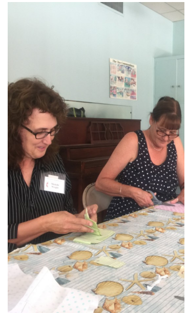
United Methodist Women