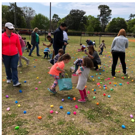
Community Easter Egg Hunt