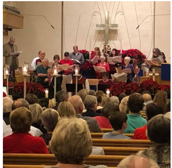
Chancel Choir in traditional service.