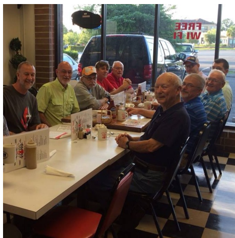
Men's Tuesday Morning Breakfast Group