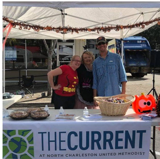
Harvest Festival Community Block Party