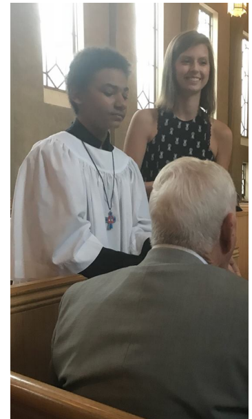
Acolyte in traditional service.

Greeters Communion Preparation Communion Servers Offering Collection Hospitality Team Sound Technician