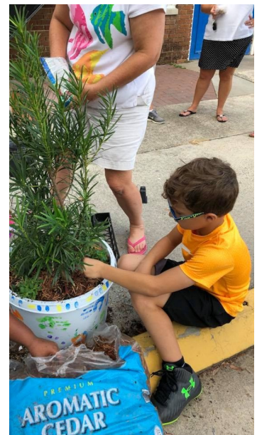
Children's Mission Day